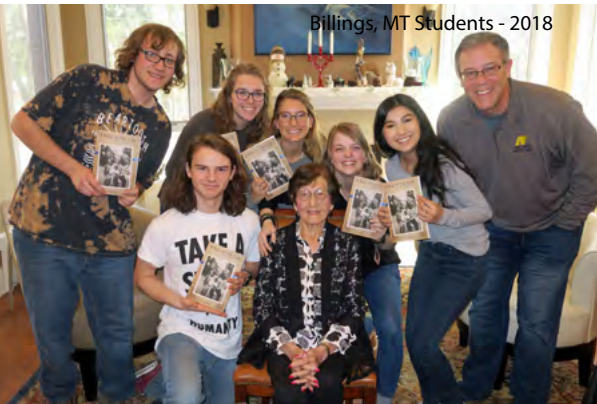
Billings, MT Students - 2018