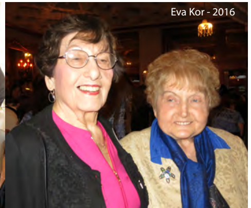
Eva Kor - 2016