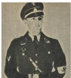
Alfred Helmut Naujocks Operation Andrew