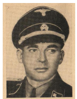
Friederich Walter Bernhard Krueger Operation Bernhard