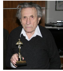
Adolf Burger With His Oscar Statuette February 4, 2010 Prague *