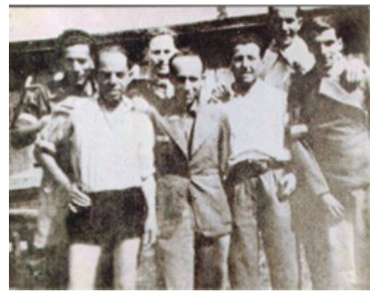
Operation Bernhard Members May 5, 1945 After Liberation