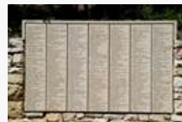
Wall of Honor #24