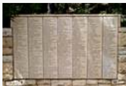
Wall of Honor #22